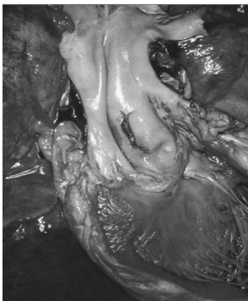
Fig. 1 Longitudinal rupture of the extended aortic root

Internally, the aortic root was grossly enlarged and 1 cm distal from the aortic valve a longitudinal rupture of the internal layer of the aorta was found (Fig. 1). The aortic